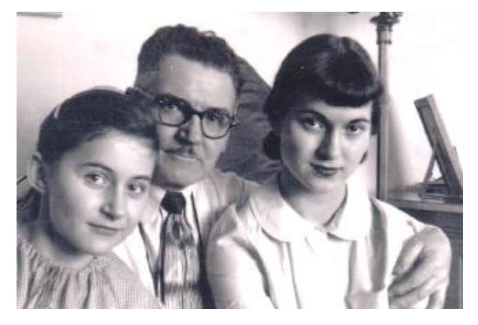
Daddy and his girls

Sat. May 31, 1952 - Went to hospital to get arm x-rayed. Only a bruise, thank heaven. But it hurts!