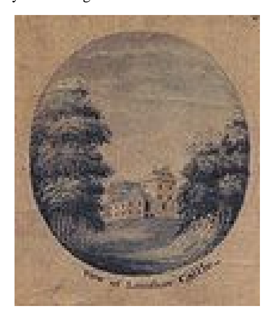
Above: Lainshaw Castle, Stewarton